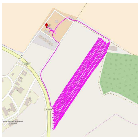
Figure 3: Tractor route (ploughing), recorded by GPS data during PEMS measurement

The tractor route for the example of a ploughing event is traced back by recorded GPS data and shown in OpenStreetMap of Fig. 3.