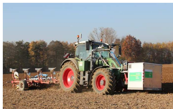
Figure 2: PEMS measurement during ploughing with a vegetable oil compatible tractor Fendt 724 SCR (Stage IV)

So far, measurement took place mainly with rapeseed oil fuel during several ploughing events as well as during cultivating and transport. Fig. 2 shows the tractor Fendt Vario 724 SCR ploughing with mounted PEMS box during RDE measurement at a test farm near Mainkofen, Germany.