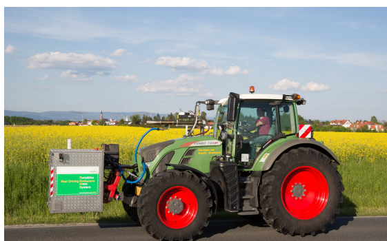
Figure 5: PEMS measurement during street transport with vegetable oil compatible Fendt 724 SCR (Stage IV)

The research will be continued by repetitive measurements of different types of tractor work for data validation (e.g. transport, see Fig. 5). Additionally, further vehicles will be tested with biofuels and conventional diesel for comparison.