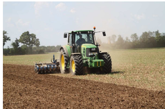
Figure 5: Plant oil compatible prototype John Deere 6930 Premium

exhaust gas stage IIIA and common-rail injection system revealed a lower power output than with diesel fuel (in opposite to the Fendt tractor with pump-line-nozzle injection - see above). Reasons therefore are differences in the net calorific value between rapeseed oil fuel and diesel fuel as well as the type, design and modulation of the injection system. Hence, general statements about increasing or decreasing performance by using plant oil fuel cannot be made. In any case, power output adjustment is possible by injection parameter modulation.