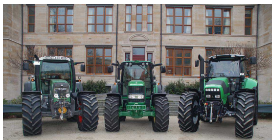
Figure 7: Presentation of rapeseed oil fuel compatible tractors with exhaust gas emission stage IIIA in front of Bavaria's representation in Brussels

For a higher share of plant oil fuel used in agricultural machinery public relation work has to be enhanced and framework conditions have to be improved for market stimulation.