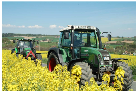
Figure 2: Plant oil compatible tractors: Fendt Farmer Vario 412 and Deutz-Fahr Agrotron TTV 1160

Regarding performance, both tractors operating with rapeseed oil fuel showed no significant change during the whole operation period. In accordance with former results a slightly higher power output in comparison to diesel fuel could be achieved with the Fendt tractor ( Figure 3 ).