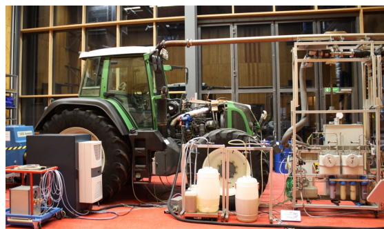
Figure 1: Plant oil compatible tractor at test stand of the Technology and Support Centre (TFZ)

06-03) was used. Tested plant oil fuel was cold-pressed rapeseed oil, complying with the national German standard DIN 51605 for rapeseed oil fuel.