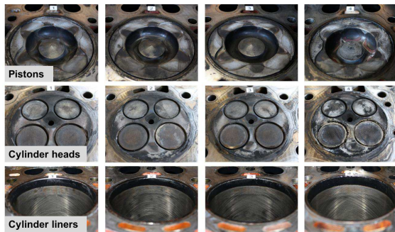
Figure 4: Pistons, cylinder heads and cylinder liners of Fendt Vario 412 (exhaust stage I) at engine inspection after 5000 h

Inspection of the engines confirmed the good condition of both tractors. Figure 4 shows the pistons of the Fendt tractor. As it can be seen pistons and cylinders were completely free of deposits with exception of harmless reddish residues at one piston (cylinder 4). Besides that, the compression pressure in each of the cylinders was at a constant high value, indicating well sealed piston rings.